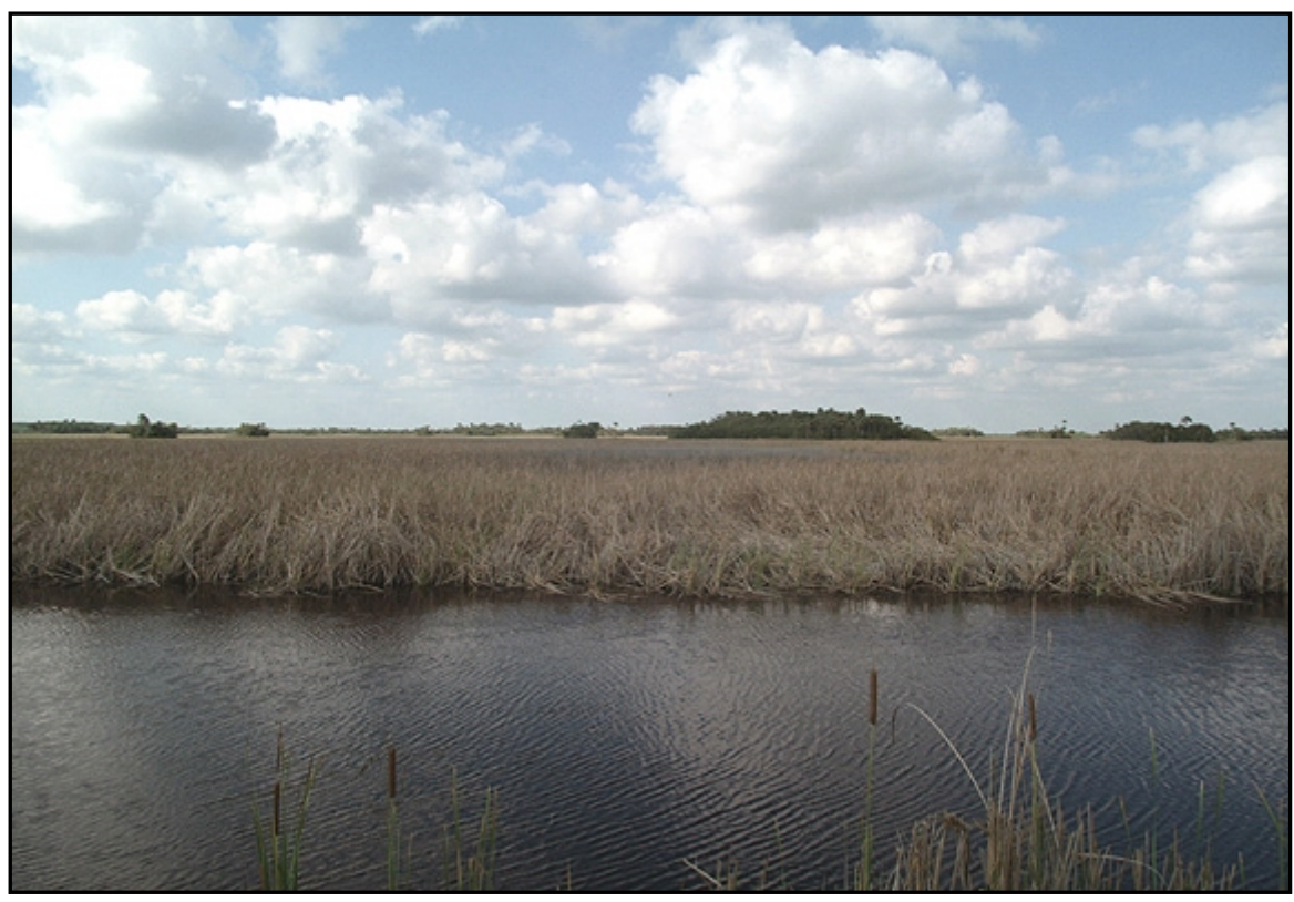
Tree islands in the Big Cypress National Preserve.

majority of the tract" to determine panther occupancy – Game and Fresh Water Fish Commission efforts notwithstanding – and he claimed that no panthers actually lived in the proposed acreage, since their primary habitat was located on the Fakahatchee Strand. The Interior Department was already involved in a process to acquire Fakahatchee Strand, Smith continued, and it was examining less expensive ways, such as exchanges, to acquire more land in South Florida. 32