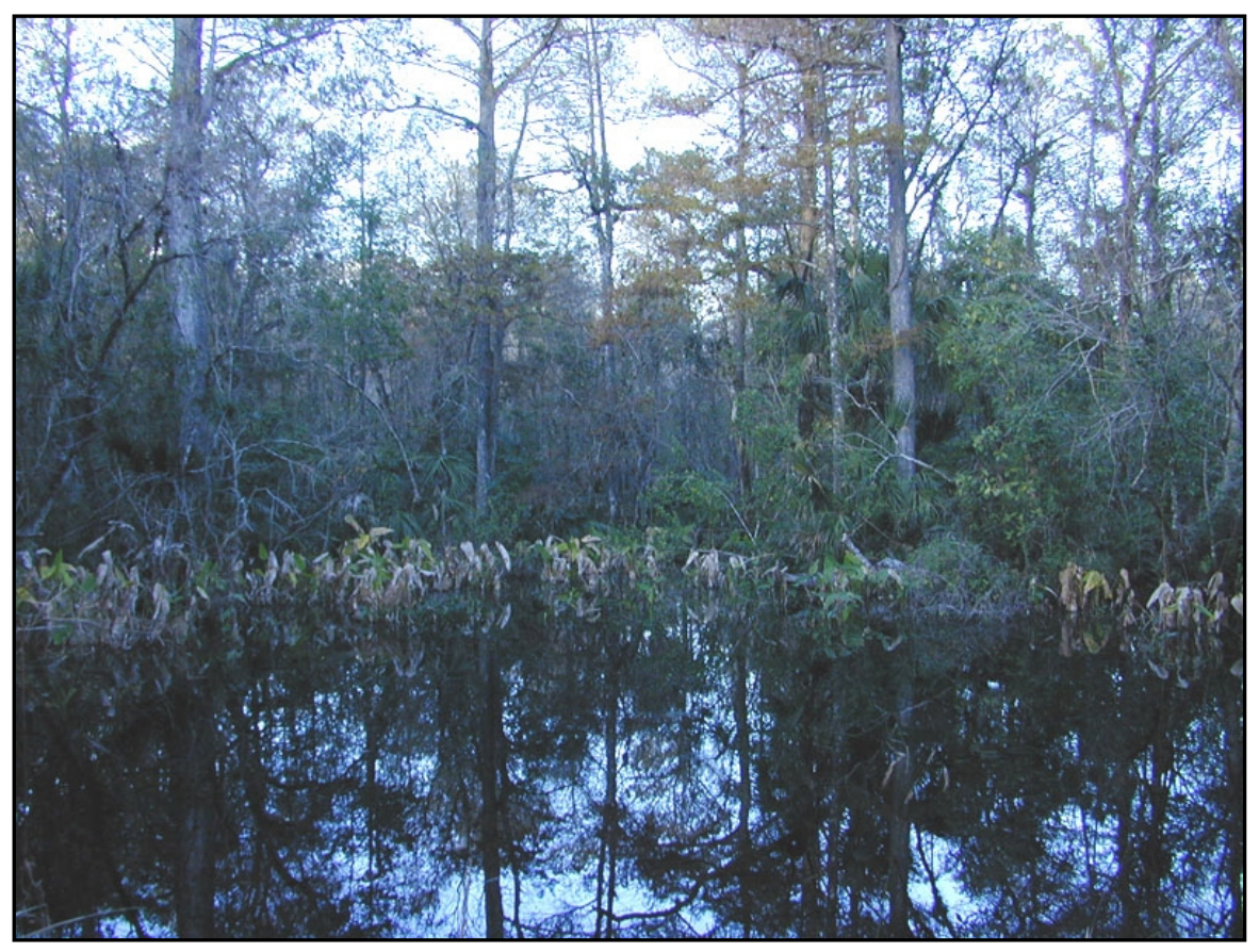
Fakahatchee Strand.

make Alligator Alley a part of Interstate 75, and it feared that this upgrade would "heavily impact the Preserve." <sup>13</sup>