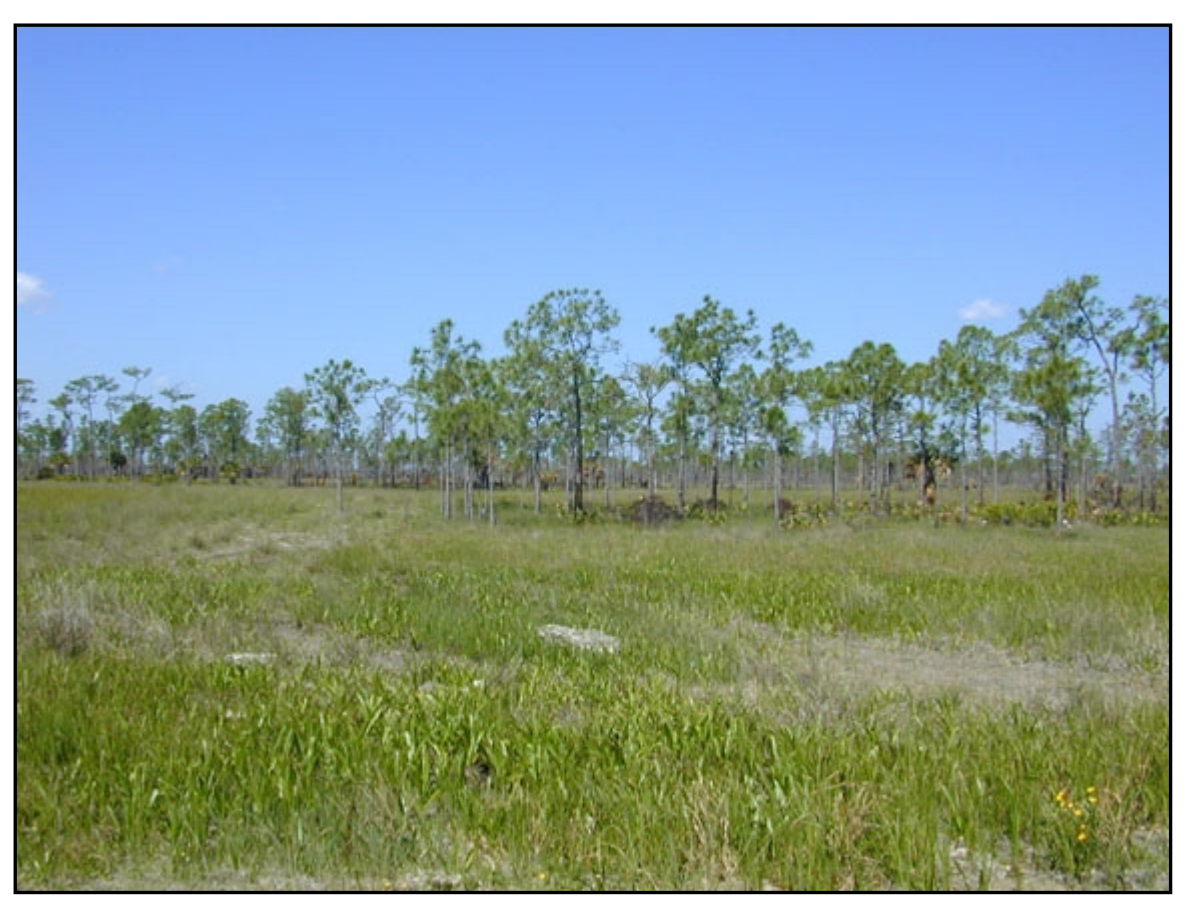
Pine prairie in the Big Cypress National Preserve.

The Interior Department, however, maintained its opposition to the measure; Horn testified that unless the bill was "amended to provide for acquisition by exchange," the department would not support it. "Our fundamental problem with S. 90 has nothing to do with the resources," Horn