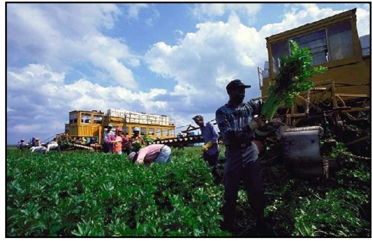
Workers harvesting vegetables in the EAA.

The development especially affected wildlife. By the mid-1980s, some estimated that approximately 90 percent of wading birds in the Everglades had disappeared, dropping the population from more than 2.5 million in the 1930s to 250,000. The alligator was similarly imperiled, as were 13 other endangered species, including the Florida panther (placed on the Interior Department's first endangered species list in 1967), whose traditional habitat north of Big Cypress was jeopardized by citrus growers building orchards in the area. The problem for the panther ( Puma