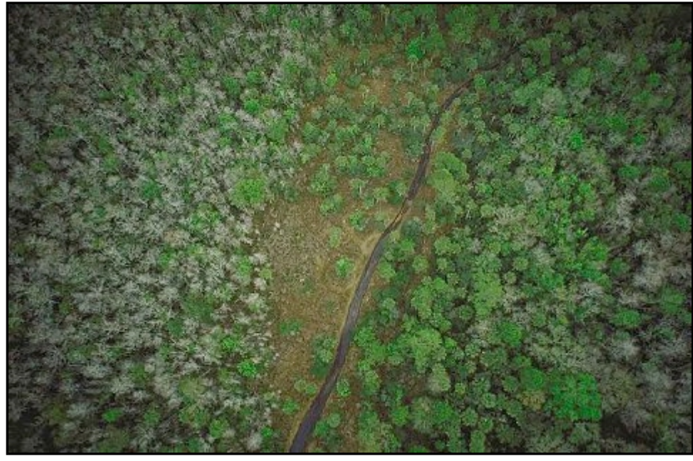
Aerial view of WCA 3.

There were several objections to the agreement between the SFWMD and the Seminole. Both environmentalists and the Miccosukee were concerned that it required only that phosphorous concentrations not exceed 50 ppb in water both entering and leaving the reservation. Vida Verde, a non-profit organization dealing with social and environmental issues, stated that "water entering and leaving the Reservation should be <u>below</u> 50 ppb in phosphorous concentrations."<sup>22</sup> The association also objected to a provision in the agreement involving the Rotenberger Tract. The original design of STA-5, located in Hendry County and bordered by the L-3 canal on the west and the Rotenberger Tract on the east, contemplated taking water from C-139 and routing it through STA-5 to the Rotenberger Tract to allow for a more natural hydroperiod on the land. Water from C-139 could then be filtered to 50 ppb before entering Rotenberger, which would cleanse it further to 10 ppb before discharging it to Conservation Area No. 3A. Under the Seminole/SFWMD agreement, however, the Seminole could take water from the Rotenberger Tract, use it on their citrus plantations and ranches, and then discharge it with a phosphorous level of 50 ppb. In Vida Verde's view, this constituted "receiving clean water, polluting it and releasing it downstream."<sup>23</sup>