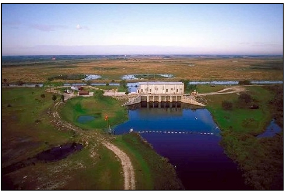
The S-140 pumping station.