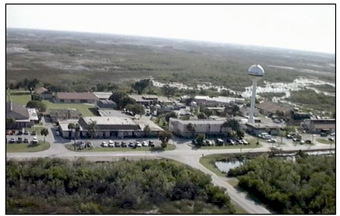
A Miccosukee Indian village.

The Miccosukee continued its assault by filing an action against the EPA as well, charging that the Everglades Forever Act had changed Florida's water quality standard and that the EPA therefore had the responsibility to either approve or reject the changes, as stipulated by the Clean Water Act. According to one observer, the tribe claimed that, under the Everglades Forever Act, the state was allowing water with high levels of phosphorous to flow across South Florida, causing "an imbalance in the natural aquatic flora and fauna through 2006."<sup>49</sup> After representatives of the EPA testified that the presence of polluted waters did not necessarily mean that water quality standards had changed, the U.S. District Court for the Southern District of Florida rejected the tribe's claim. The tribe appealed the ruling, leading the Eleventh Circuit Court of Appeals to remand the case back to the district court, instructing it to decide independently whether water quality standards had been altered. After its review, the district court ruled that a change had been made, and it instructed the EPA to take action. The EPA again stated that the act did not alter the standards, claiming, according to one legal scholar, that "it did not change any designated uses of downstream waters" and that "it did not change anti-degradation policy."<sup>50</sup>