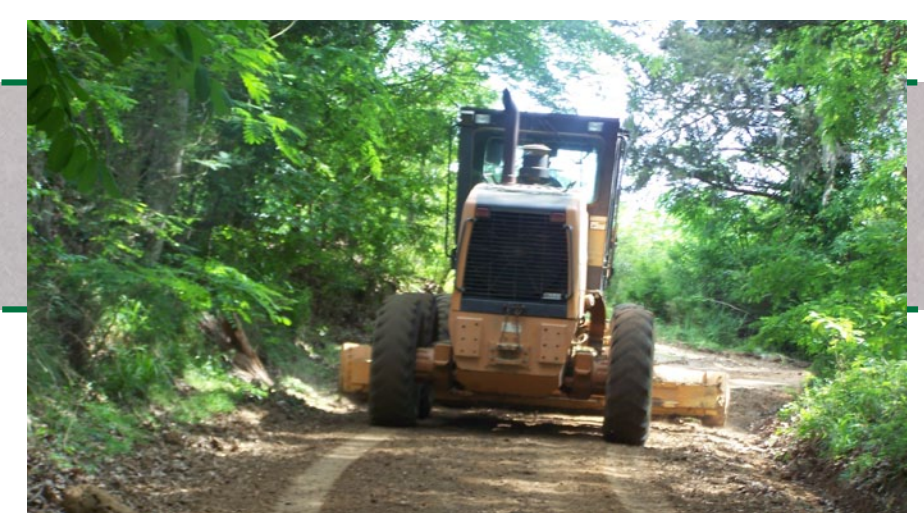
Motor grader working a county road. Timber on the slope belongs to the adjacent landowners if the county has no right-of-way.

also signaled his intent for the county to use this strip of land, depending on the language in the conveyance, at least along the frontage of the conveyance.